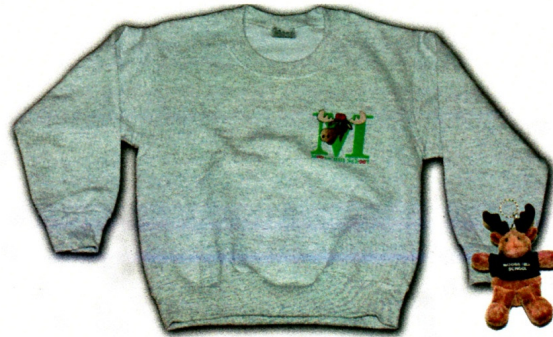
Note: Sweatshirt & Keychain pictured above